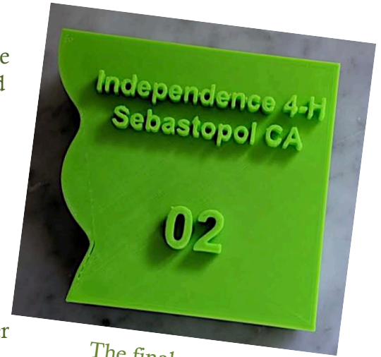
The final product!